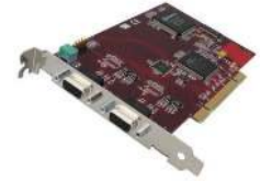
RocketPort uPCI 8-Port SMPTE